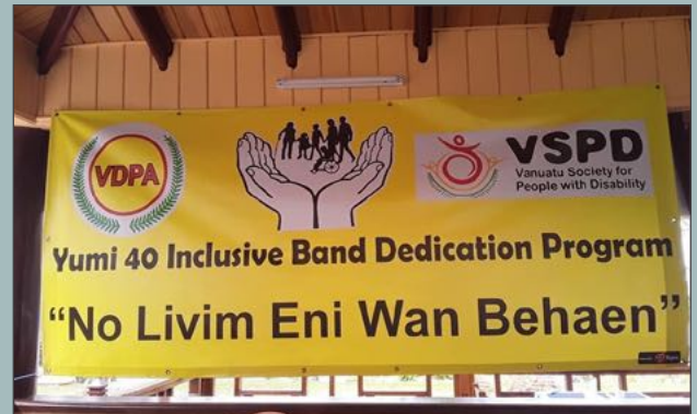
Yumi 40 Inclusive Band banner on the day of their dedication. "No Livim eni wan behaen" – "Leave no one behind".

Some of the band members struggle to do things we often take for granted, like walking unassisted, or seeing your loved ones everyday.