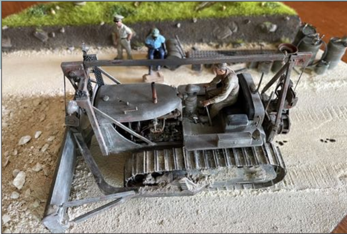
The D7 model features amazing details including actual steel tracks.