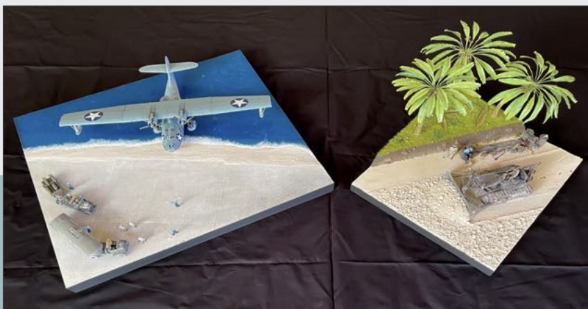
The two completed dioramas, ready for their journey to Espiritu Santo.

Once the borders reopen to Vanuatu, the dioramas in their custom road crates will make their way up to the Museum with James and go on display.