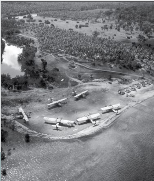
The seaplane base upon which the diorama is based.