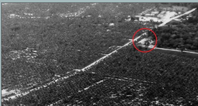
The military cemetery is shown in the red circle. Navy Hospital #6 is in the centre bottom of shot.

Additionally, records held by the US Archives have brought to light the names of those who were temporarily buried there prior to making their way to their final resting place - all 442 of them.