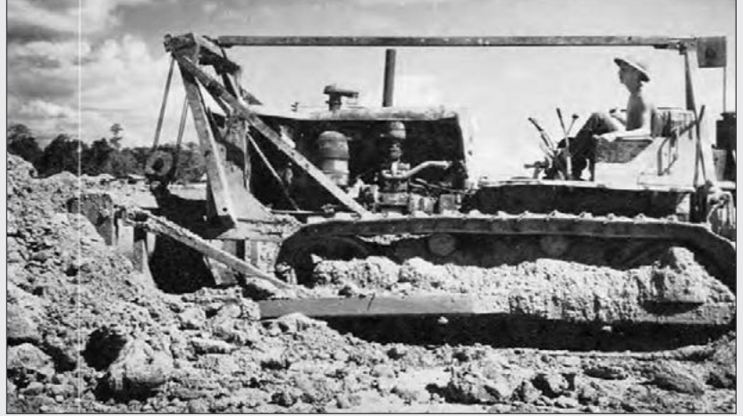
The mighty Caterpillar D7 dozer in action in the South Pacific.

The dozer is pushing a pile of crushed coral out of the way prior to rolling. To one side is a Navy officer supervising and Seabee mechanic having a smoko. For those with a keen eye,