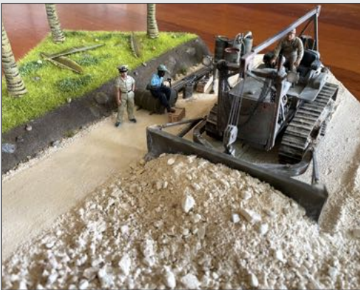
It's amazing how 'kitty litter' can look like crushed coral.