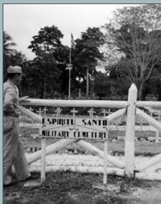
The entrance to the Santo Military Cemetery.