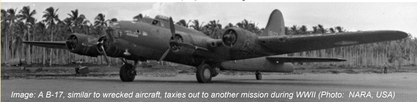
Image: A B-17, similar to wrecked aircraft, taxis out to another mission during WWII

While the site had long been included in Espiritu Santo's WWII tours and visited on numerous occasions, the identify and nature of the wreckage is still unclear, which part of the Museum works will aim to unfold and help put together factual information relevant to the wreckage.