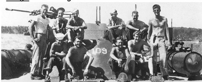
Image: JFK far right with his PT109 crew

What made PT109 famous was from the incident of 1 August 1943 when it was struck by Japanese destroyer, Amagiri , which got PT109 crew into dark water to then swim ashore and struggled to survive and finding help with fear of being caught by the Japanese, given their proximity from where they came ashore. The crew was later rescued on August 8th, with Kennedy later awarded the Navy and Marine Corps Medal for his courage and leadership. John F. Kennedy later became America's 35th President.