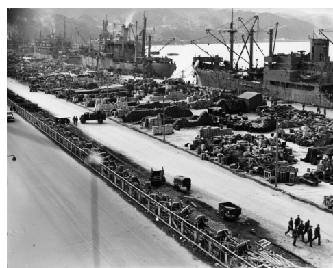
Aotea Quay, Wellington, July 1942.

In July 1942, the US 1st Marine Division set sail from Wellington, New Zealand, destined for the invasion of Guadalcanal. There are many nice times to be in the picturesque harbour capital of the country, but July – in the middle of a winter – is rarely one. The Marines were faced with having to unload their transports and reload them so they were ready for a combat landing. It required round the clock work on the exposed docks of Aotea Quay, stung by driving southerly rains and wind. The city also turned on another of its specialities for the Marines – a powerful earthquake that sent chimneys toppling. But by the end of the month, what was – until D Day - the largest invasion convoy to set sail was underway for Guadalcanal, and the unknown.