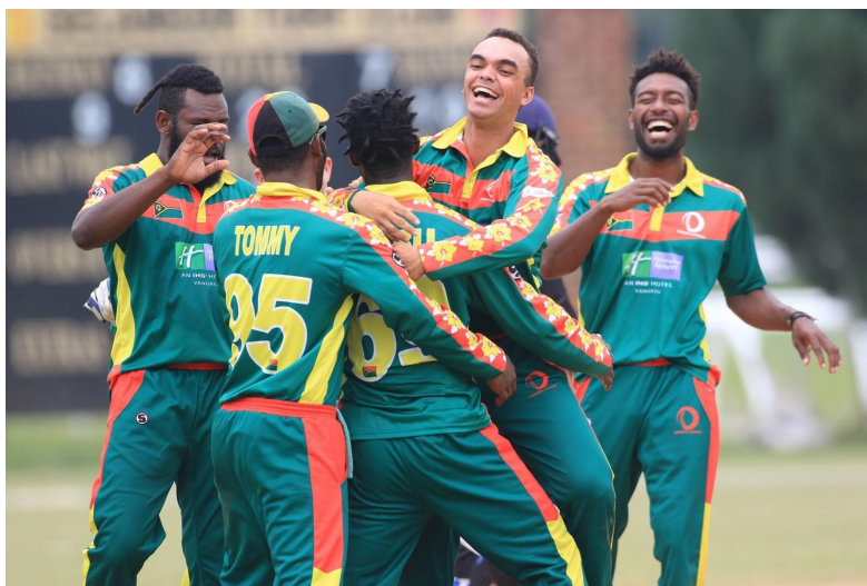
Winners! The Vanuatu cricket team over Malaysia.