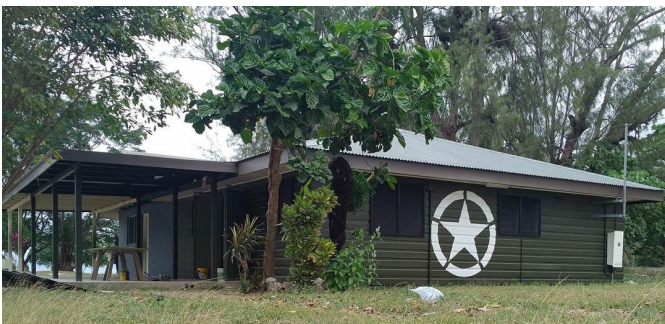
Image: The Museum Project Development Office approaching its completion, at the Museum site.

A similar display setup will also be at the Pekoa International Airport, aiming to open this October together with the 75th Memorial of Captain Elwood J Euart .