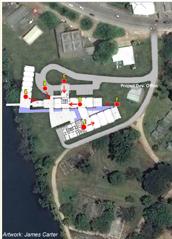
Artwork: James Carter

To give you some idea of the museum site location, we've overlaid our architect's building plan on top of the satellite image of the area. The labels on the map below are the corresponding reference of how the architect's renderings will look from those angles.