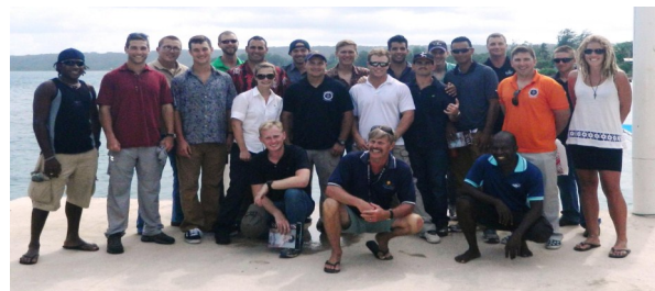
Image: Part of the US recovery team & local operators - March 2015