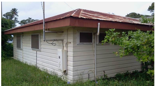
Image: Current museum office before renovations, located at eastern corner of the museum site

Renovation has started on the 02 nd of June, aiming to complete by August. Inside the office will also be a display section of some of the museum's collection to date.