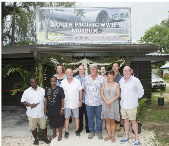
Image bottom right: Former Deputy Prime Minister of Vanuatu Sethy Regenvanu accompanied by other dignitaries to visit a foundation stone he laid over a decade ago at the site, with his vision for a museum. The SPWWIM Project fulfills this vision.