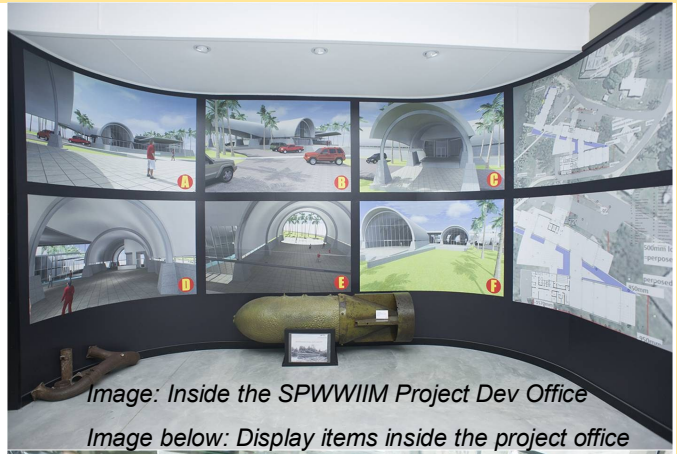
Image: Inside the SPWWIM Project Dev Office