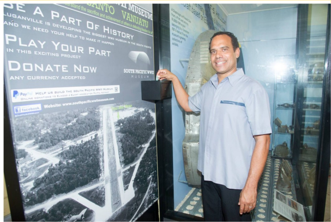
Image: Minister Regenvanu makes first donation

The Museum Association thanks the board and management of Airports Vanuatu Limited (AVL) for supporting the Museum project and giving space at the airport for this special exhibit.