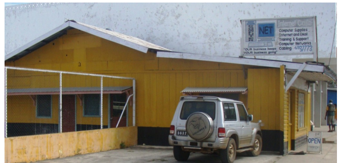
The house, now dismantled, where the piece of wood was recovered