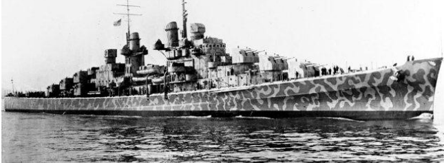
Image: USS Juneau before it sunk. On March 17th its wreckage was discovered in the South Pacific. It sunk during the Battle of Guadalcanal, killing 687 men including all five of the Sullivan brothers.

Paul Allen's submersible has earlier found the wrecks of the famed heavy cruiser USS Indianapolis and the Japanese super battleship Musashi.