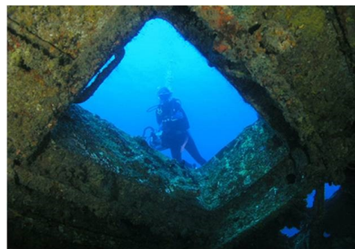
USS Tucker's diving site today at Espiritu Santo

On August 3, 1942, the USS Tucker, DD-374, sailed in the water to the west of the Segond channel. She had received orders to escort the SS Nira Luckenbach to Espiritu Santo, and on 1 August, the two ships departed by way of a route north of Efate Island and west of the Malekula Islands. Threading their way through the channel, both ships then set courses to enter the Segond Channel for the final leg of their voyage to Espiritu Santo. At 2145, Tucker struck a mine which exploded and broke the destroyer's back. She slowed to a halt, mortally stricken, and began folding up. The explosion instantly killed three men. Nira Luckenbach quickly sent boats to aid in rescuing the destroyer men as they abandoned their sinking ship. Attempts the next day to tow the Tucker failed and she jack-knifed and sank in 10 fathoms. It was sad end for a ship that had survived the attack on Pearl Harbour. The Tucker of course remains the second most famous wartime shipwreck near Espiritu Santo – after the SS Coolidge , which also would sail into a US minefield less than three months later with fatal results.