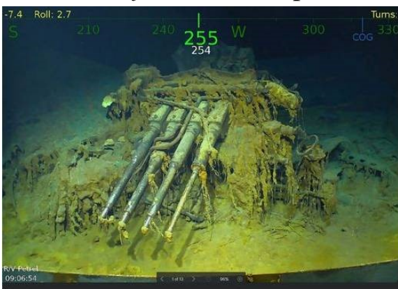
A shot from the video of the USS Lexington wreck site, showing an anti-aircraft mount.

We're delighted to announce we will be allowed to screen the remarkable footage gathered by the team led by US philanthropist Paul G Allen.