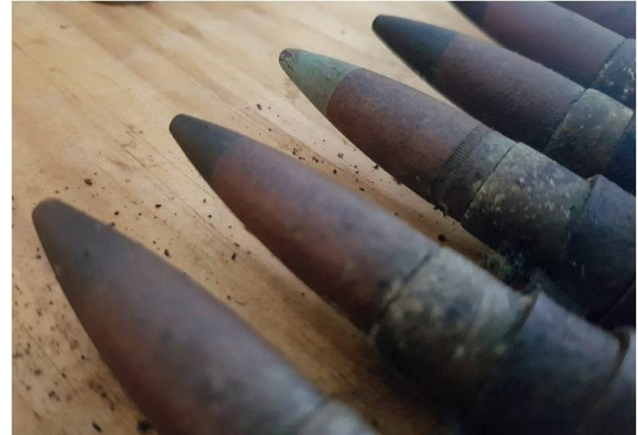
Souvenirs? Strictly not.

Sadly this month we've seen a case of a visitor to Vanuatu taking potentially dangerous wartime items out of the country.