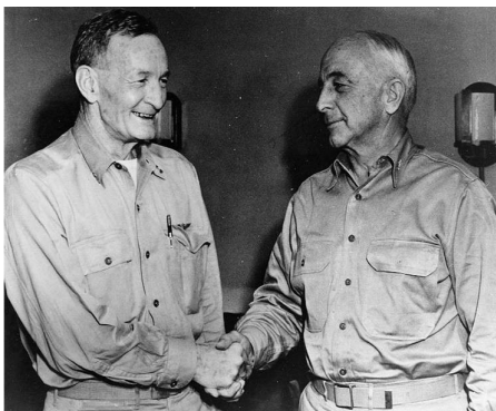
Rear Admiral John Slew McCain (left) shakes hands with Rear Admiral Aubrey W. Fitch on the occasion of McCain's relief by Fitch as Commander, Aircraft, South Pacific Force, 21 Sept 1942. Photo may have been taken onboard USS Curtis (AV-4) at Espiritu Santo

The sad news of the death of Senator John McCain late this month is a reminder of his grandfather's crucial role in Espiritu Santo becoming the pivotal base in the South Pacific war. Admiral John Slew McCain as commander of US air forces in the South Pacific was the first to recognize how critical Espiritu Santo was if Japan was to be stopped. His son, the father of Senator McCain, later became commander of the Pacific Fleet during the Vietnam war. And it was in that was that Senator McCain as a young pilot was shot down and held prisoner for five years. A remarkable fighting family.